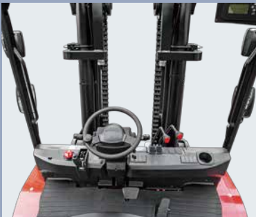
New designed broad view mast provides better forward view ability

You can open the door on each side, it make the motor, oil pump and electrical controller maintenance is very convenient, provide good waterproof and dustproof