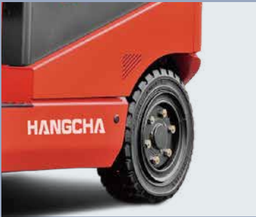
Small dimension solid tyre