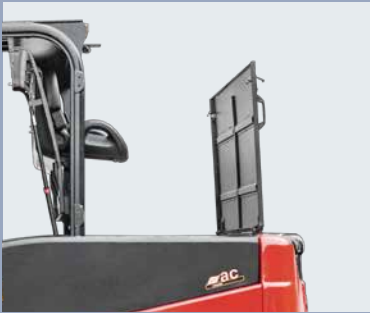
Full opened battery cover is easy for battery service