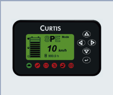
Human-computer interaction dashboard