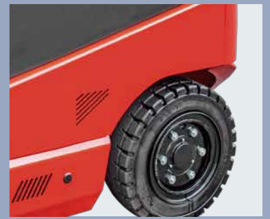
Small dimension solid tyre