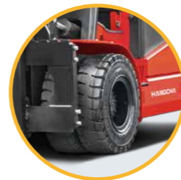
Front dual tyre

/ International advanced Full-AC controller can control the travelling, lifting, braking and turning action. It provides stable and accurate control, speed control performance is superior, regenerative braking, reverse connect braking, anti-slope and other functions, make the operation more efficient, safe and comfortable.