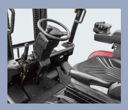
The larger brake pedal and the function of regenrative braking,reduce the fatigue of the driver dramatically