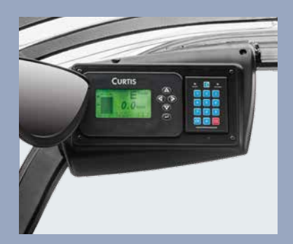
Easy to see dashboard is relocated to overhead, no restriction of the operator's visibility. The forklift is also applied PIN code access for better management.