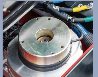
Electrical Park Brake (EPB) system