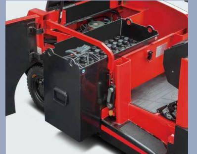
Battery side roll out is taken as the standard configuration in order to easily and fast replace the battery