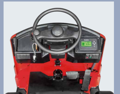
Modern outline design with LCD instrument and USB charging port