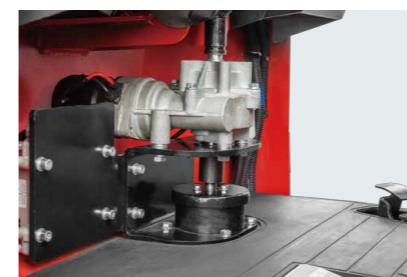
Electronic power steering system (for stand-up driving type tractor)