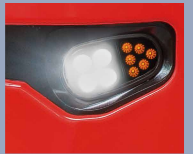
Reliable LED lighting