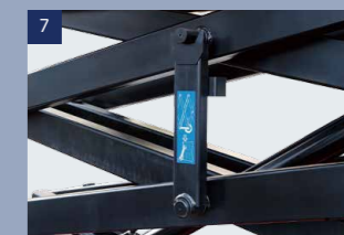
Supporting arms: To protect the operator when he is doing repair or maintenance job