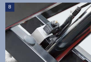
Explosion proof valve: To prevent the machine falling when the oil pipe is leaking