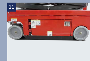
Anti-overturning system: When the machine raises to more than 2m, this system will work automatically, to protect the machine from overturning while walking at un-leveling ground