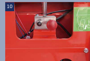
Manual release valve: When the machine can not move, you can push the machine after pressing this valve