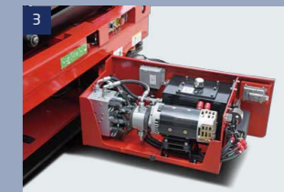
Hydraulic and electric system