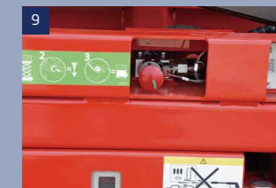
Manual lowering valve: When the operation system failed or the battery power is too low to let the platform decline, we can use this valve to lower the machine