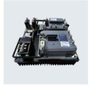
Advanced full-AC power system, full closed, compulsory air-cooled, reliable and safe